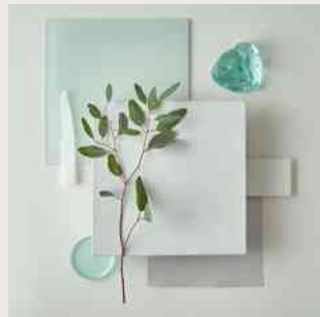
Sleek minimalism that completely blurs the boundaries between inside and outside: Crystal Lounge.