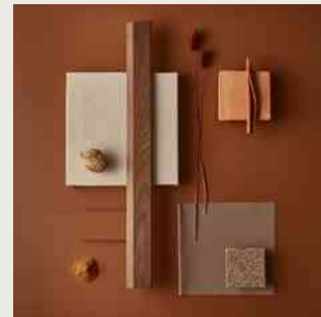
Warm, southern colours, textures and materials for an instant summer feeling: Earth Oasis.