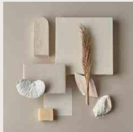
Limestone, sand and natural white tones and textures for an airy atmosphere: Pure Essence.