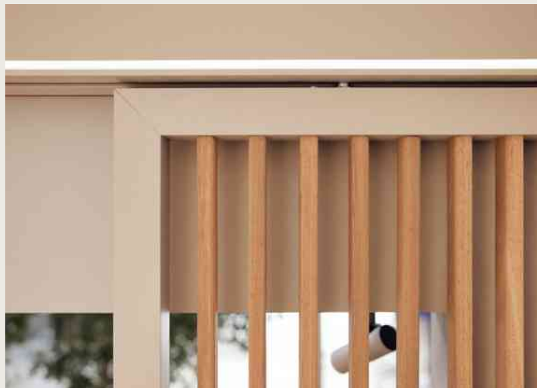
Elegance is what makes Amani different. Wall coverings, folding and sliding panels that glide past the beam to the edge of the roof , contribute to a harmonious space.