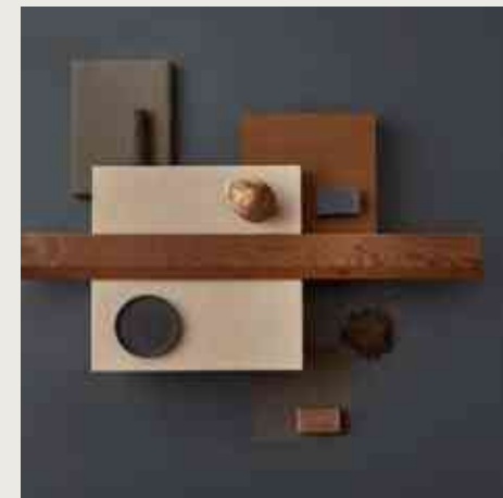
A minimalist style in a dark colour palette, inspired by traditional Japanese architecture: Spiritual Harmony.