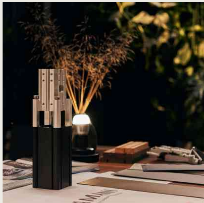
Crafted with passion, refined with precision.