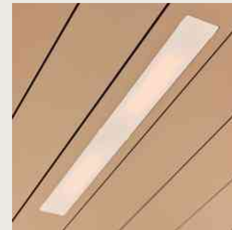
Heating in fixed blade