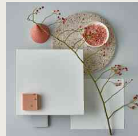
Radically contemporary and young, with a warm undertone of dynamic playful colours: Tech Cocoon.