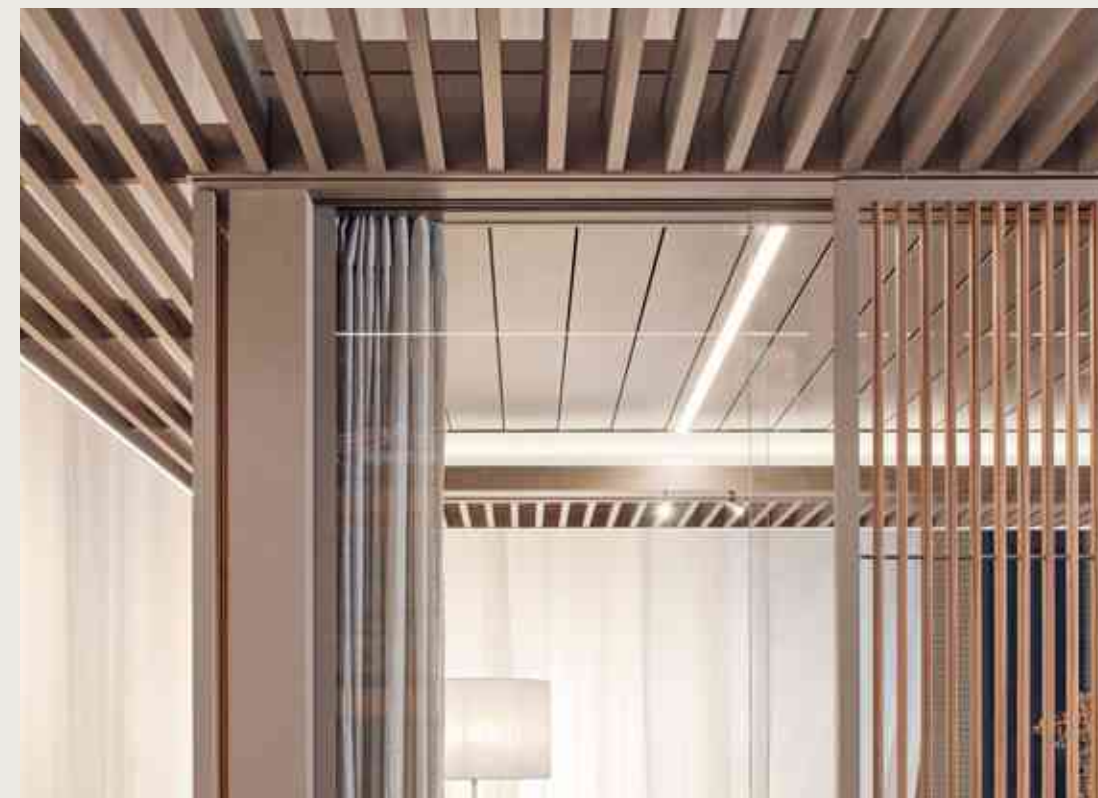
The Amani roof structure allows you to have up to four options per side . Screens, curtains, wall coverings, folding and sliding panels: choose and combine to create the perfect space.