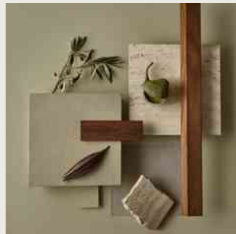
A refreshing and timeless look with Italian touches for maximum enjoyment: Idyllic Garden.