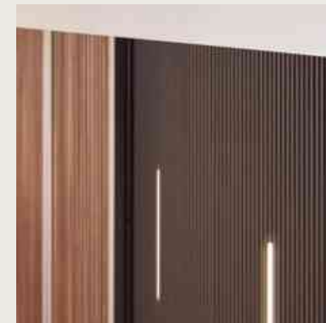
Fixed Linarte wall