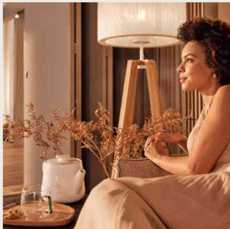
A perfect place to unwind.