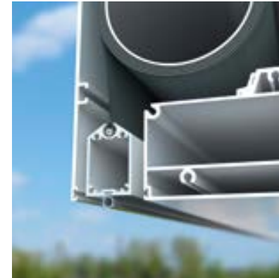
Bottom bar disappears into the Camargue box

The integrated Fixscreen is fitted with our patented Connect&Go technology. This new development provides an enormous advantage for installation, as well as for removing the fabric roller tube when replacing a screen or motor.