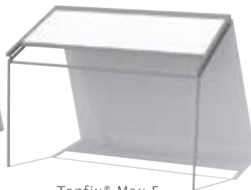
Topfix® Max F