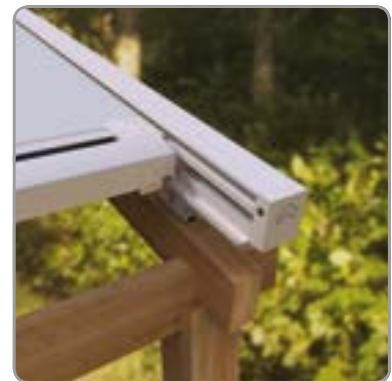
Mechanical safety for the bottom rail